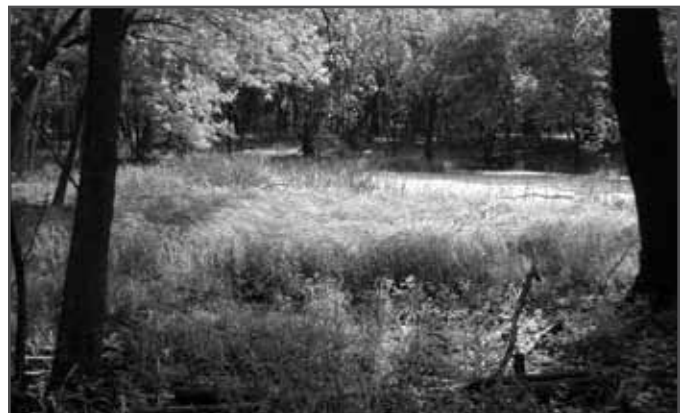
A restored savanna at the magical Zander Woods.

The last project, at Zander Woods near Thornton, is well underway and will be completed in 2011. This extremely sensitive site is home to many unique and rare species including lilies, fringed gentian and royal fern. Continued on next page