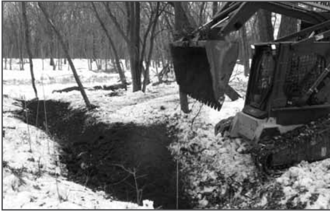
Soil block installation at Salt Creek Nature Preserve.