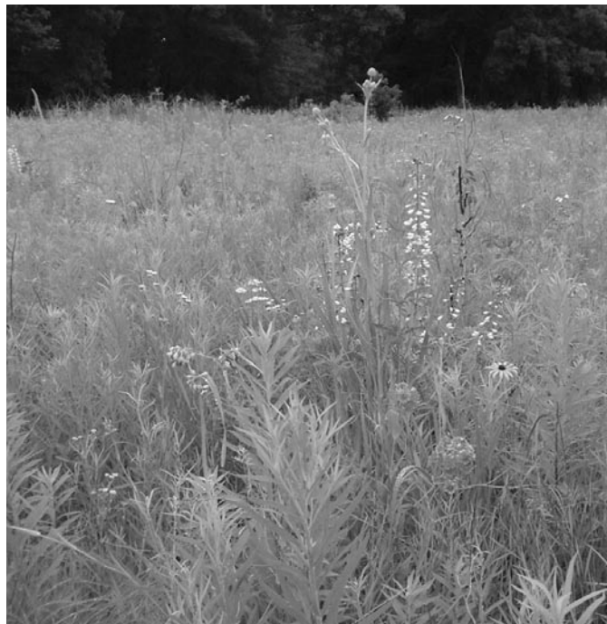
Culvers Root at Green Lake Savanna.

Friends will use its GLRI grant to enhance habitat at Green Lake Savanna and Sand Ridge Nature Preserve located in southeastern Cook County. These sites are close to Lake Michigan and provide critical habitat for over 300 species of migratory birds that stop over in the area each year to rest and feed. Project work will include the removal of invasive species such