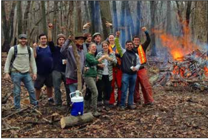
Centennial Volunteers, a program focused on recruiting and training the next generation of ecological stewards, helps steward LaBagh Woods on the north side of Chicago, removing invasive brush to help restore health to the woods.