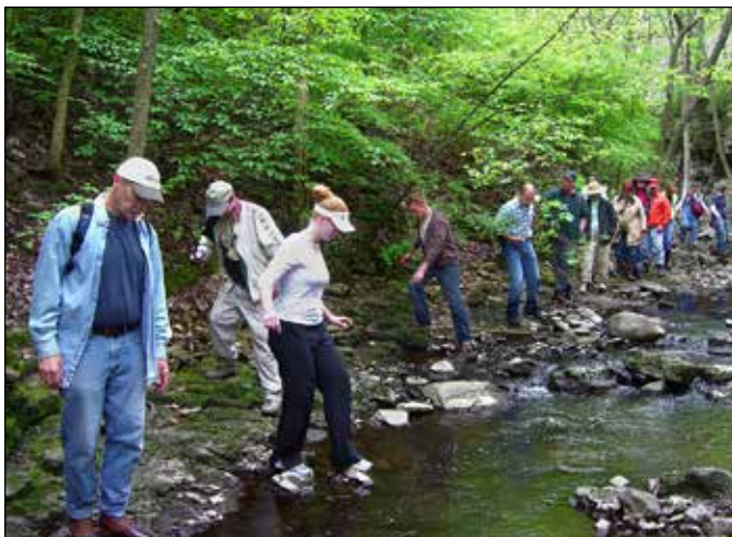
Friends community members tour Camp Sagavau, Cook County's Grand Canyon. Engagement is vital to ensure people love, enjoy, and protect the preserves.