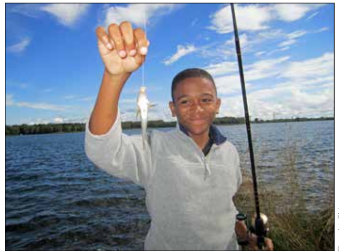
This young fisherman caught a fish and learned a lesson about an invasive species, the round goby. The mission of the preserves is to hold natural lands together with their plants and animals for the education, pleasure, and recreation of the public.