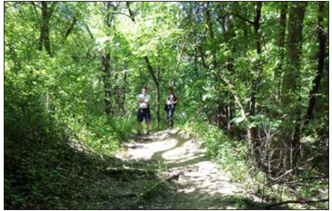
Volunteers Jeff Skrentny and Radhika Miraglia assess an unofficial trail at LaBagh Woods, where the Friends community has come together to remediate problems.

In Riverside, working with local community members, we requested permission to perform maintenance on a 900-foot-long segment of an unofficial trail that connects a sidewalk and an intersection with a bus stop. We also re-